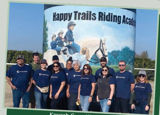
Kaweah Cares Work Day