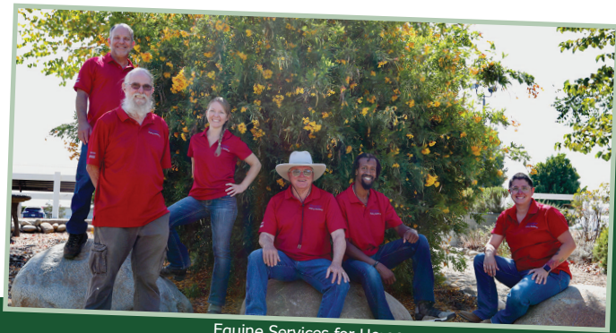
Equine Services for Heroes