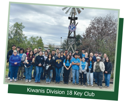
Kiwanis Division 18 Key Club

Happy Trails Riding Academy is a premier accredited program which enriches the lives of children and adults with physical, cognitive and emotional disabilities through equine-assisted services.