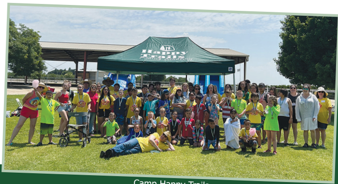
Camp Happy Trails