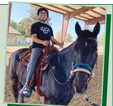
German & Bam Barn

By setting the bar high, working hard, collaborative efforts and your support we are established as one of the premier centers in the country.